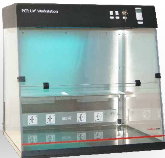
PCR UV 2 Cabinet & Workstation

Two styles are available: The standard PCR UV and the PCR UV HEPA systems.