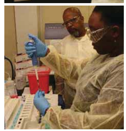
Students in a BD Good Start workshop